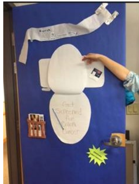
Partnership Health Center staff decorated their clinic doors as part of Colorectal Cancer Awareness Month activities.